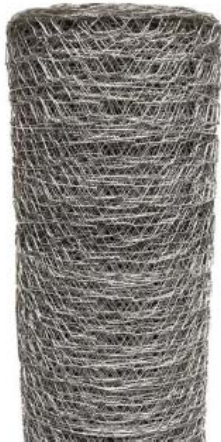
Hover Image to Zoom

1 in. x 1 ft. x 50 ft. Poultry Netting (Brand Rating: 4.1/5)